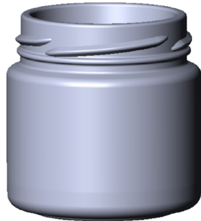
VISTA FRONTAL FRONT VIEW